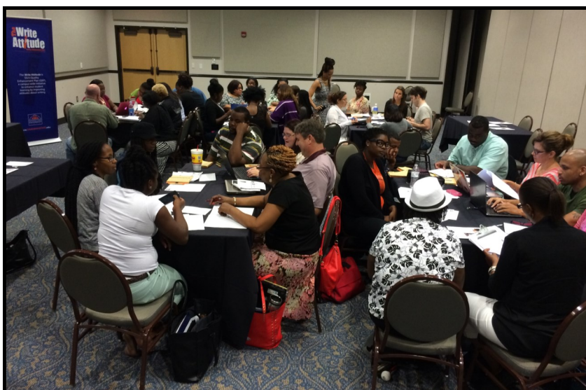
Master of Social Work Students participate in a writing activity during a Writing in the Professions Workshop, developed in partnership with SSU Quality Enhancement Plan.