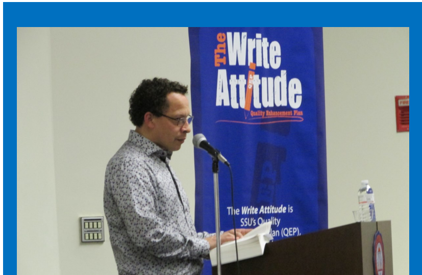
Lawrence Hill reads from his The Book of Negroes at Savannah State University, on October 16th, 2014.

Both shared their knowledge and experience with students, faculty, staff, and community members in events that were free and open to the public. After the lectures, the authors answered questions, signed books, and took pictures with the audience members.