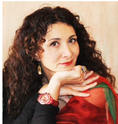
Poet Sholeh Wolpé

Wolpé is a translator of international poetry and stressed how important fluency of language and writing is in order to capture the essence of what the writer is trying to convey. Translation also is a way she feels that people can connect outside of the media and on a deeper level. Her three collections of poetry: Rooftops of Tehran , The Scar Saloon , and Keeping Up with Blue Hyacinths are world-renowned and have won her various awards.