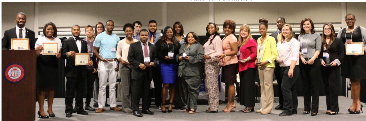
SSU Graduate and Undergraduate student award winners at the 5th Annual Research Conference