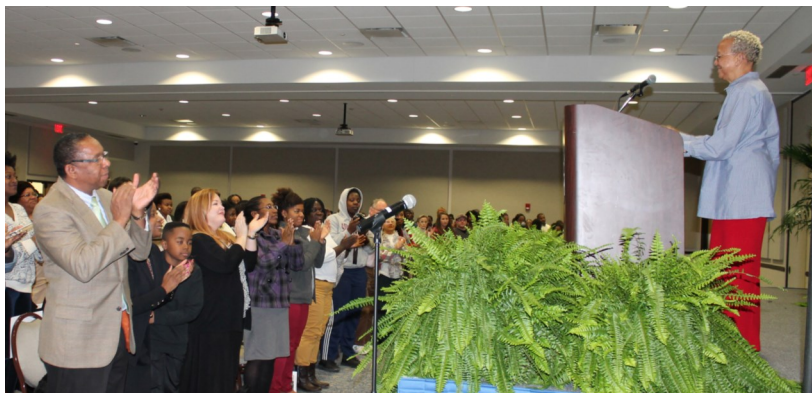
Nikki Giovanni delights the SSU family during QEP Week 2014.

order for this generation to understand the future, we have to read about the past, to become familiar with it. She expressed how important it is to read and write and to become knowledgeable in this day and age.